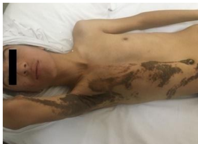
Figure 2: Epidermal nevi on chest.

Asymmetrical vertebra, kyphosis, scoliosis are the difficulties for central blocks. Skeletal hypertrophy and overgrowth add difficulties in positioning the patients. Vascular malformations in PS predispose patients to intracranial hemorrhage as in our case. 200 cases have been reported up to now, but none has been associated with intracranial hemorrhage due to the AVM malformation. Primary involvement of lung diseases, kyphoscoliosis causing secondary restrictive lung diseases are the reasons of perioperative respiratory failure [5,6].