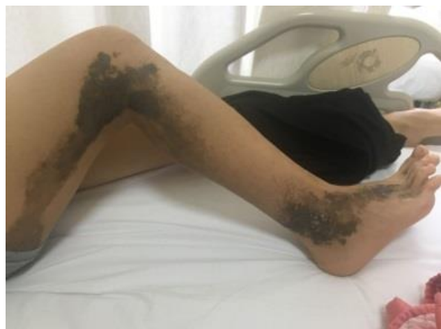
Figure 4: Skin lesions on right leg.

Ambu LMA can be also used in case of airway rescue. It is an alternative technique to be on mind and avoids critical attempts in case of difficult intubation.