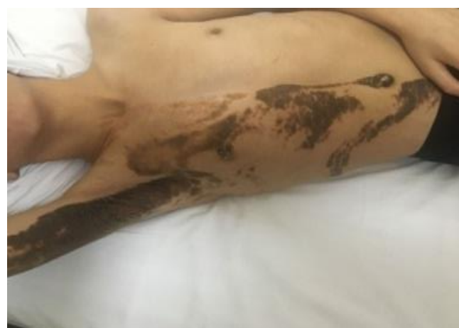
Figure 3: Skin lesions on chest.

Lung diseases lead to repeated pneumonias, atelectasis. Poor respiratory system can cause respiratory failure. Preoperative pulmonary function tests can be done. Hypertrophic cardiac rhabdomyomas is rare but always to be on mind (Figures 4 and 5).