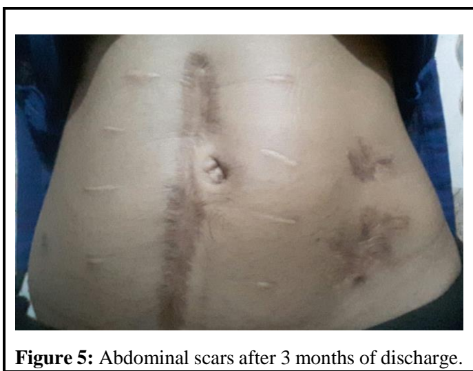
Figure 5: Abdominal scars after 3 months of discharge.

Patient passed flatus on 5 th post-operative day and tolerated oral food from the next day. Drains were removed on the 5 th post-operative day. Wounds over gluteal and iliac regions were conservatively managed on dressing and antibiotics. The total duration of hospitalization was 24 days and patient were discharged with advice of daily dressing of these wounds. First follow-up was after 15 days of discharge and subsequent two follow-ups were after one and three months of discharge. She has been asymptomatic on follow-ups. Figure 5 shows her scars after 3 months of discharge from hospital.