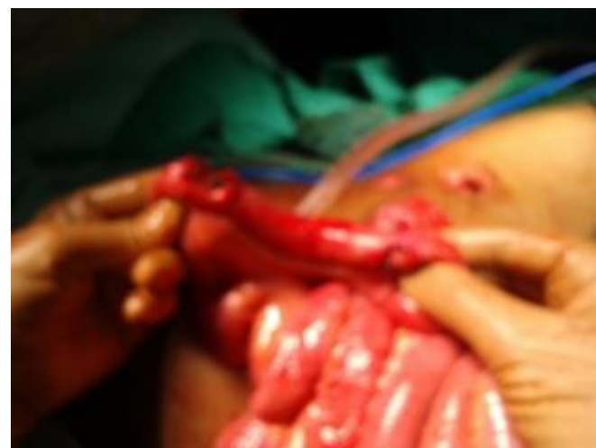
Figure 3: Proximal jejunal segment showing 2 perforations.

gluteal muscles. The passage was washed with hydrogen peroxide and saline and packed with betadine-soaked gauze. She was then turned supine and laparotomy was done through midline incision. One of the rods was seen to pierce the jejunum twice at approximately 30 and 40 cm from the duodeno-jejunal junction (Figure 3).