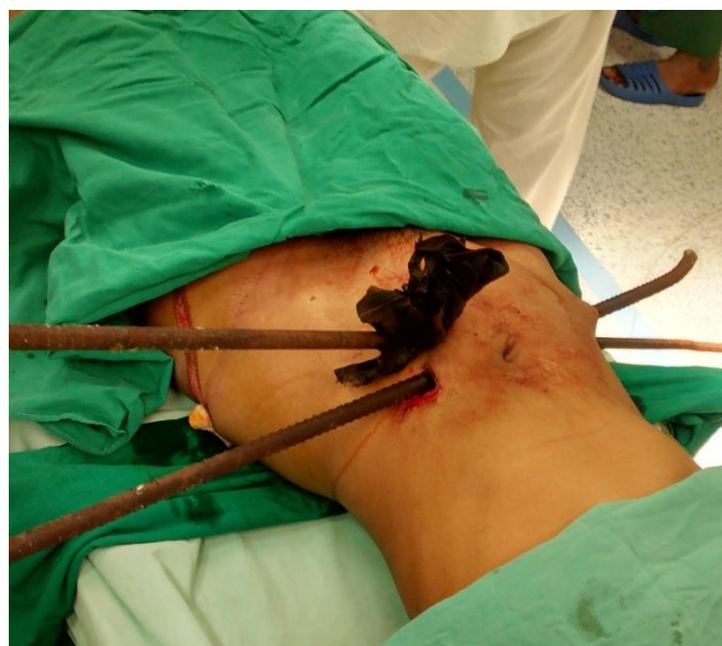
Figure 2: Patient in supine position after removing the first rod (showing 2 other rods penetrating the abdomen).

A part of her cloth also went inside the path of the iron rods. Blood clots could be seen at the entry and exit wounds. Abdomen was not distended, and child had passed clear urine once on her way to the emergency department. There was no evidence of any injury to the chest, head, neck, spine or the extremities. At arrival, along with the primary survey, an intravenous line was secured to start fluids, antibiotics and analgesics. Tetanus toxoid and tetanus immunoglobulin were administered. Simultaneously, samples were sent for routine blood investigations and cross match. Haemoglobin was 8.9 and haematocrit was 27. Chest, abdominal and pelvic skiagrams were taken to assess the passage of the rods and any bony injury. One of the rods could be seen penetrating through the right iliac bone.